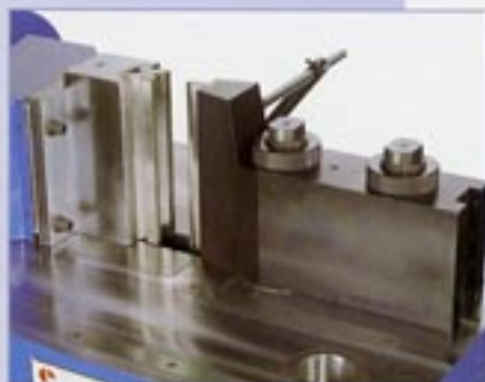
Multi-vee bending tool for thin plate