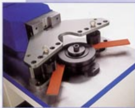
Flat plate edge bending tool for up to 50mm(w)x12mm(t)