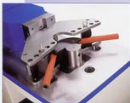
Pipe bending tool for up to 2" pipe to 90° angle