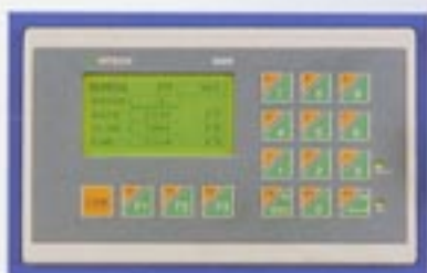
Programmable control panel with user friendly interface