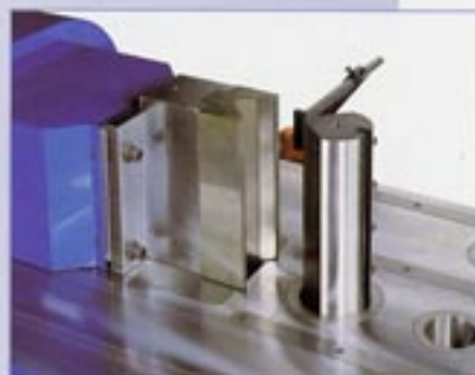
Single-vee bending tool for thick plate